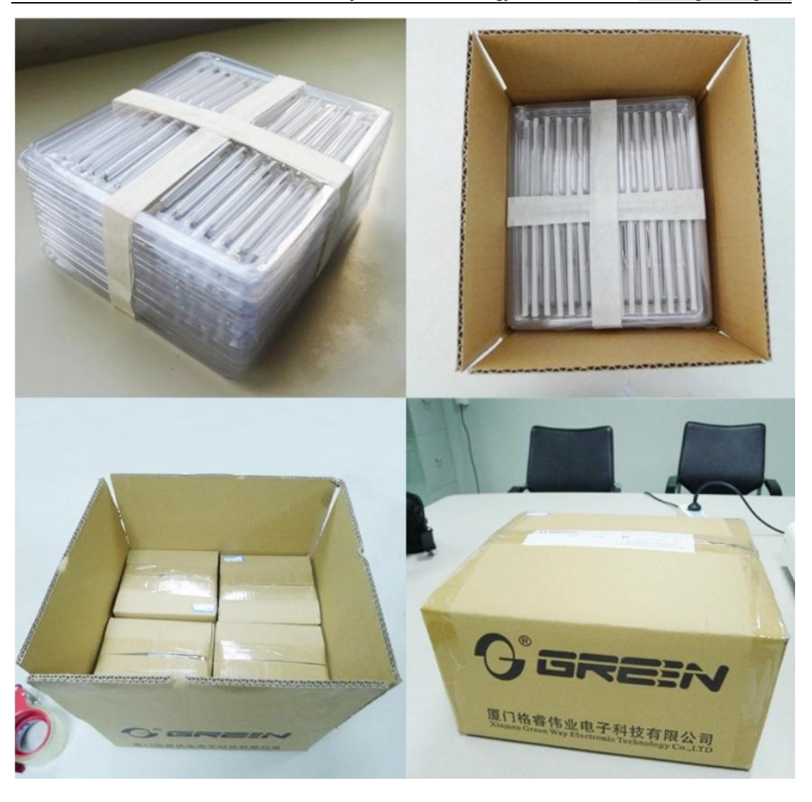
Fast International Express Delivery such as DHL,TNT,FEDEX, UPS ect.