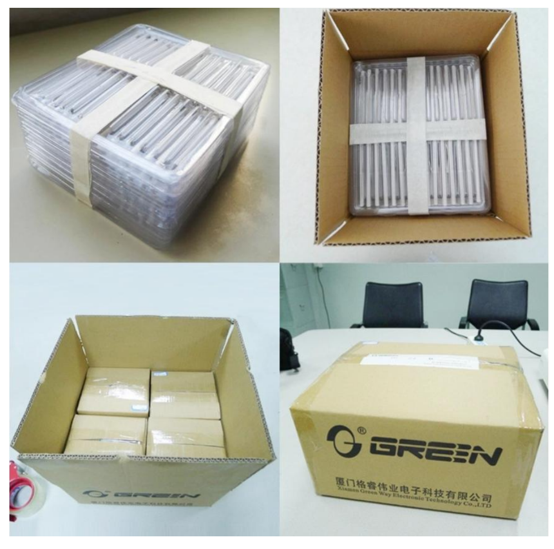
Fast International Express Delivery such as DHL,TNT,FEDEX, UPS ect.